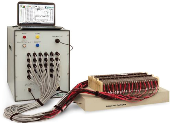
EVC-30 battery reconditioning unit connected in parallel to a 28-module Prius pack. One parallel connection does the job.

A full-time EVC-30 is fully paid off in 3 1/2 months!