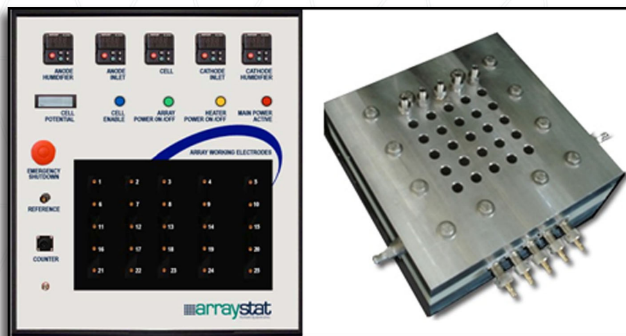
NuVant's Array Potentiostat (Arraystat) and Parallel Array Flow-Field Fuel Cell

NuVant Systems, Inc., with a U.S. Department of Energy Small Business Innovation Research (SBIR) grant, developed testing equipment that eliminates the need for multiple test stations and provides a convenient way to test MEAs realistically and rapidly. The Arraystat™ requires only one pair of mass flow controllers and a single operator to run the equivalent of 25 single-cell test stations. In addition, a separate parallel array fuel cell test fixture allows a membrane to be screened in an actual fuel cell environment. NuVant's patented technology uses an array MEA. The counter electrode of the array MEA consists of a single large area standard fuel cell electrode, while the array side consists of a library of 25 catalyzed spots. Each spot consists of a user-supplied gas-diffusion-layer disc that is catalyzed by the end user's method and is attached to the membrane. The assembly is then housed in the patented array fuel cell through which fuels and oxidants are delivered. The completed assembly may then be connected to the Arraystat, which can be routed to a computer using the associated software to gather and analyze the data. The Arraystat individually addresses each electrode disc. This method allows for the preparation and testing of various MEAs with high throughput under realistic catalyst loadings and reactant flow rates.